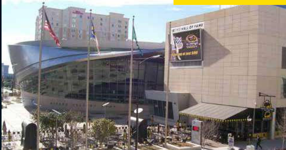
NASCAR HALL OF FAME